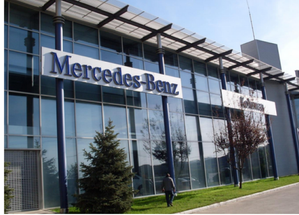
Istanbul / Mercedes / 2100 m2