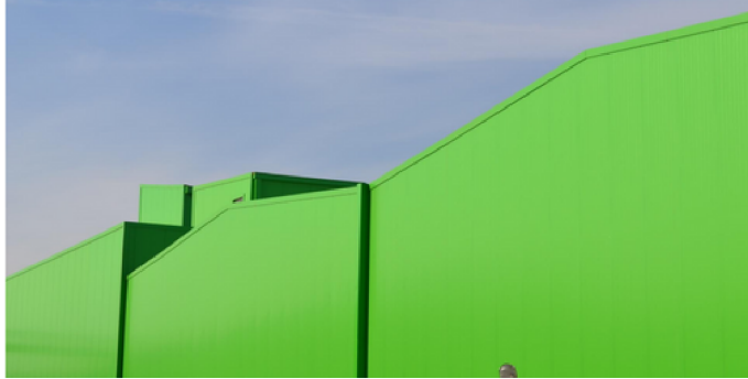
Balıkesir, Turkey, Roof, Facade, Steel Structure, Cold Warehouse 35.500 m 2