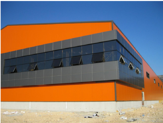
Kastamonu / 6300 m2