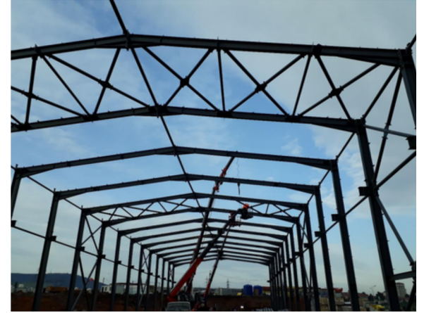
Nurol / Istanbul 14000 m2