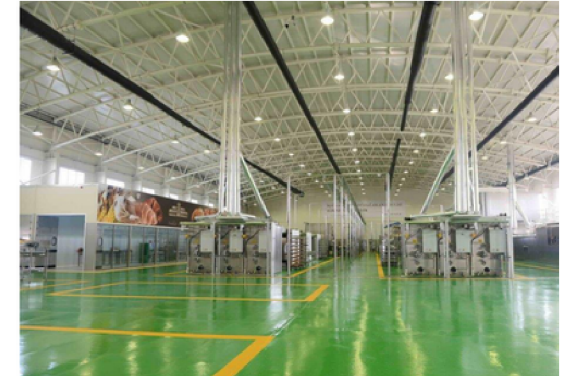
Azerbaijan, Bread Factory Steel Structure, Roof, Facade 22000 m 2