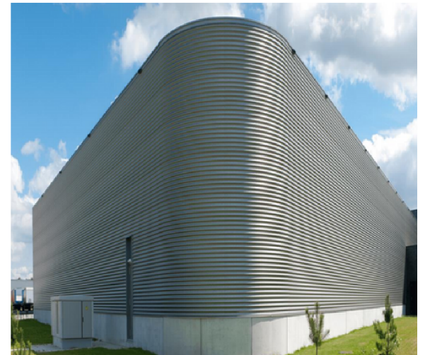
Moldovya, 3100 m2