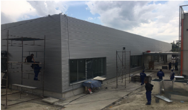
Teklas, Bulgaria, Mercedes, Roof, Facade 17200 m 2