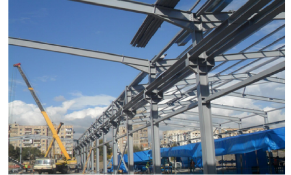
Tbilisi, Georgia, Roof, Facade Panel, Steel Structure 7500m 2