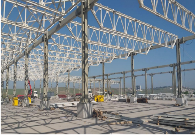
Bursa / 22000 m2