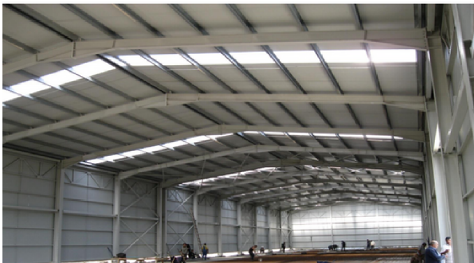
Yevlax, Azerbaijan, Steel Structure, Roof, Facade 5500 m 2