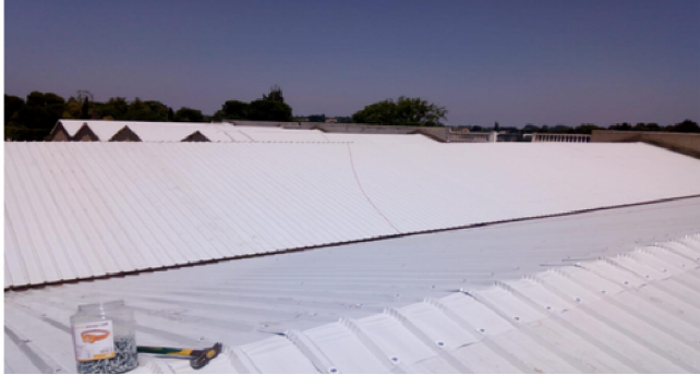
France, Roof 3054 m 2